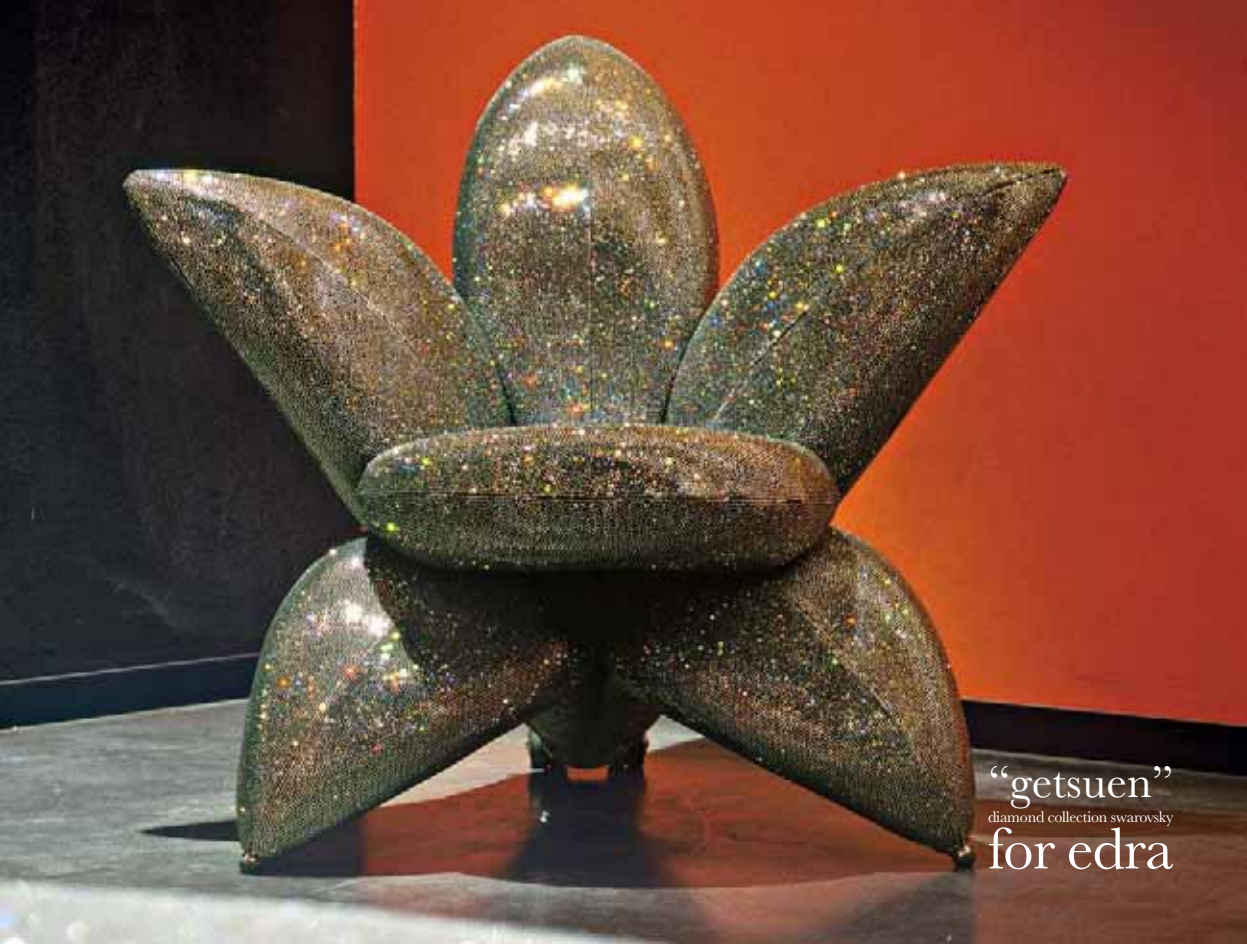
“getsuen” diamond collection swarovski for edra