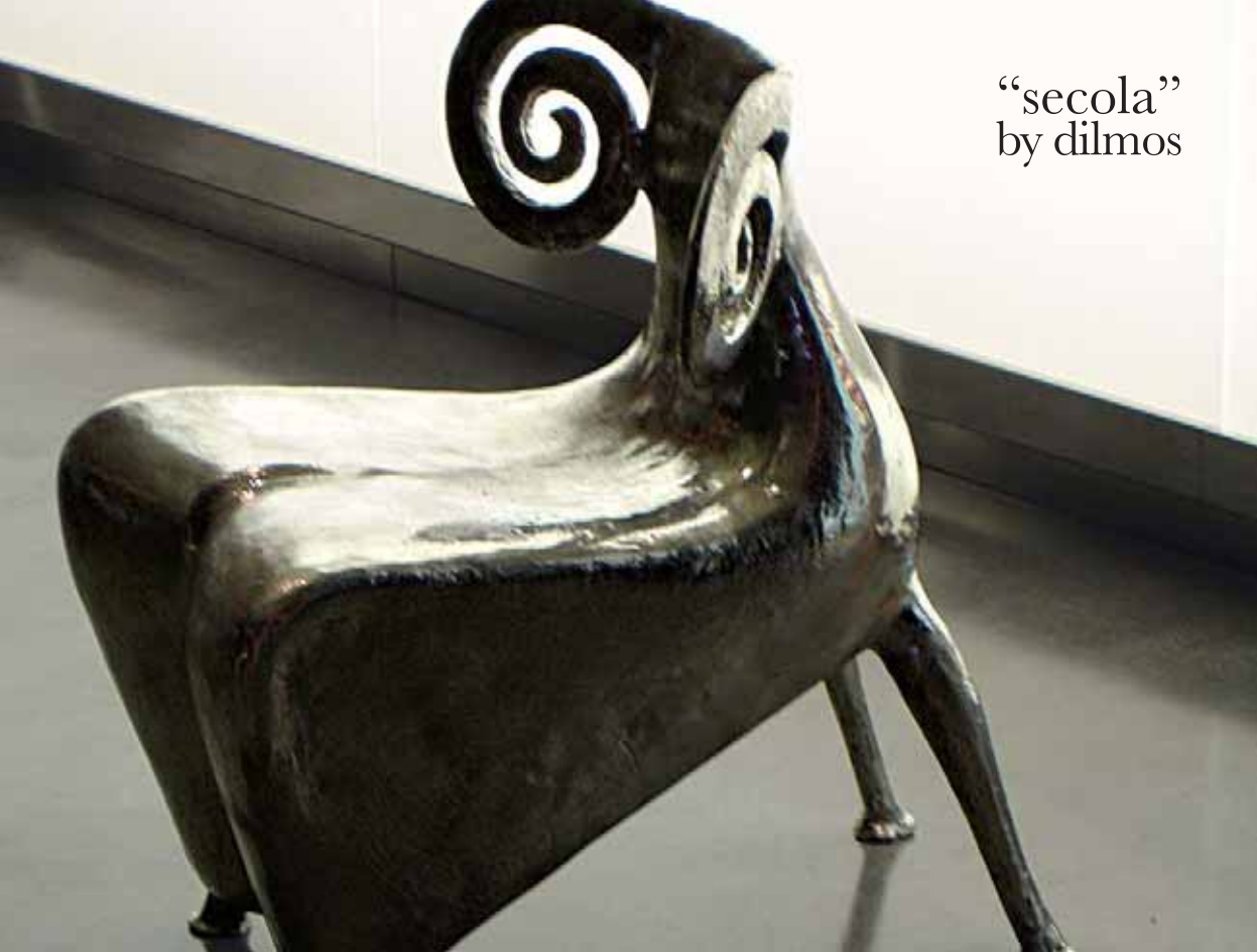
“secola” by dilmos